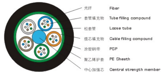
光纤 Fiber 套管填充物 Tube filling compound 松套管 Loose tube 缆芯填充物 Cable filling compound 涂塑钢带 PSP 聚乙烯护套 PE Sheath 中心加强芯 Central strength member